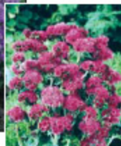
Ageratum F1 'Red Sea'