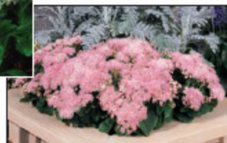
Ageratum F1 'Packstar Rose'