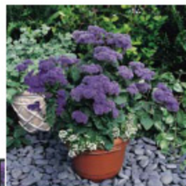
Ageratum F1 'Leilani'

Pests / diseases: Aphids, Botrytis, slugs, spider mites, thrips and white fly