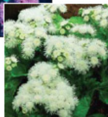
Ageratum F1 'Packstar White'