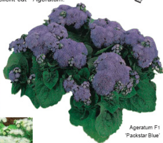
Ageratum F1 'Packstar Blue'