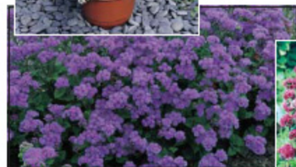
Ageratum F1 Triploid 'Blue Horizon'