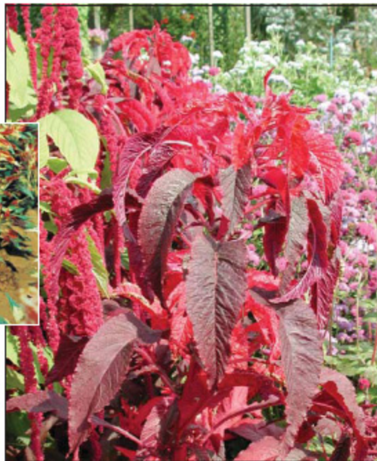
Amaranthus Tricolor 'Early Splendor'