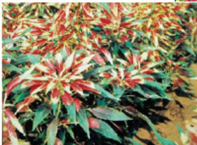
Amaranthus Tricolor 'Splendens Perfecta'