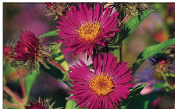
Aster novae - angliae 'Septemberrubin'