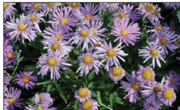
Aster Alpinus 'Superbus Goliath'