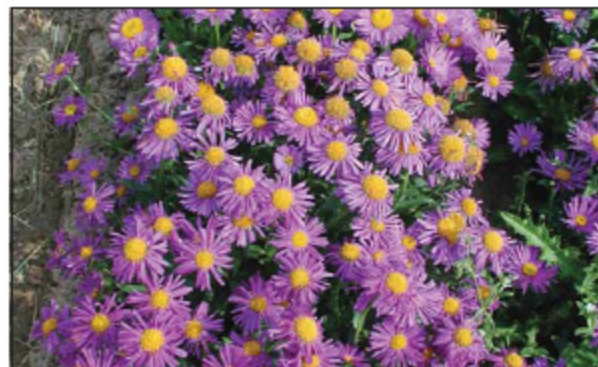
Aster Alpinus 'Superbus Dunkle Schöne'