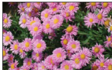
Aster Alpinus 'Happy End'