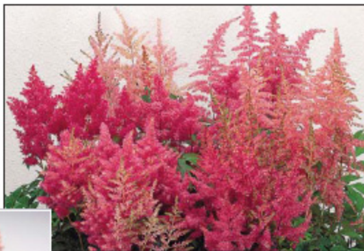
Astilbe arendsii 'Bella'