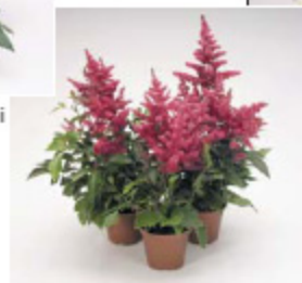
Astilbe arendsii 'Astary Rose'