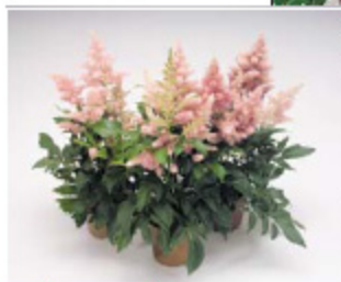
Astilbe arendsii 'Astary Pink'