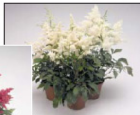
Astilbe arendsii 'Astary White'